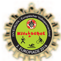
3 rd Europiade, Kitzbuehel Medal, with Austrian Governing Body inscription